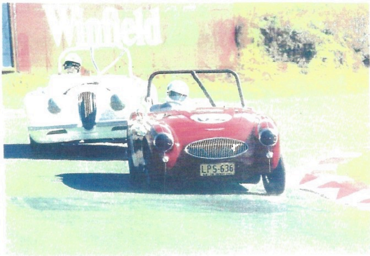
WILAROO PARK, SYDNEY - AUGUST 1983.