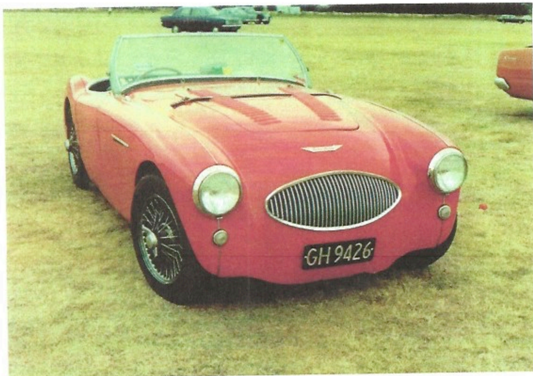
3802 WIGAM JAN 1974 or 75