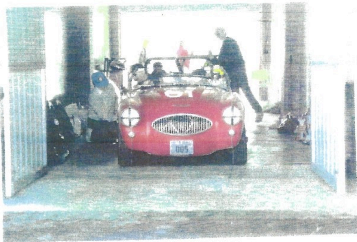
EASTERN CREEK, NEW SOUTH WALES, 1995