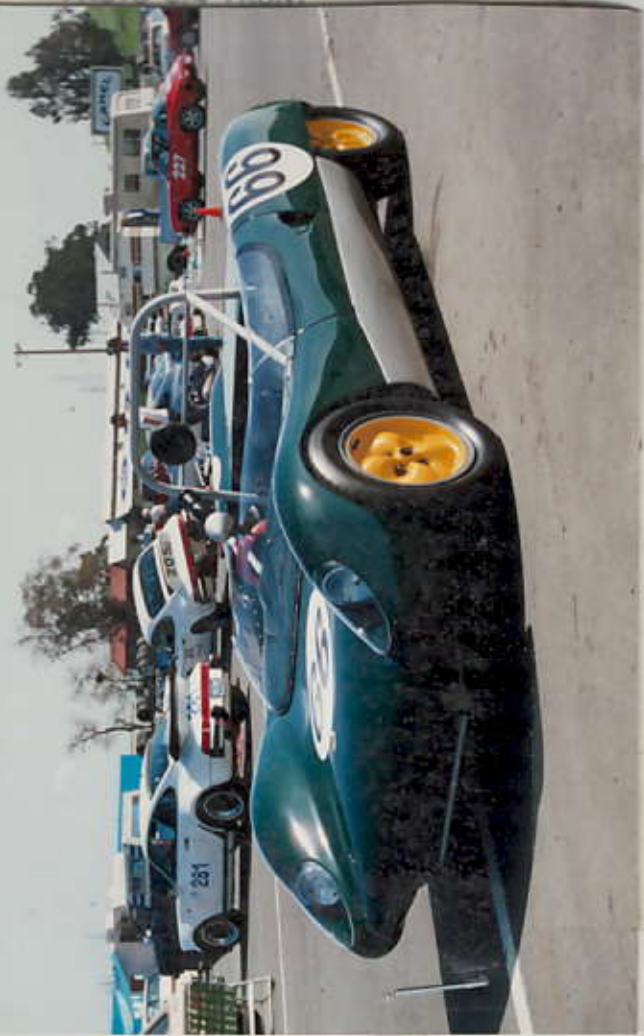
PHOTO 3/4 REAR