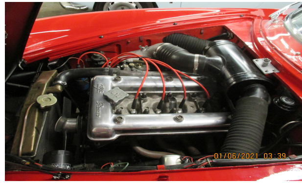
Remade carb support bracket to clear carb linkage, new spark plug wire set.