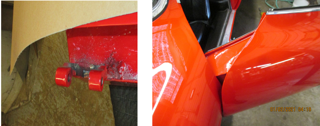
Welding additional material to hinge to keep door from hitting bodywork.

Remove drivers door to correct the hinge to prevent door from over opening and causing severe body damage. With door removed weld additional steel and the integral steel casting to engage stop sooner. Refit door and note much better.