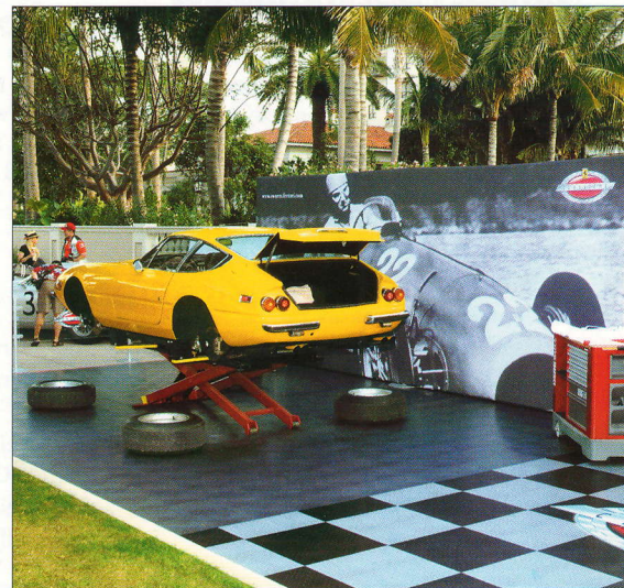
David Brady Image

Right, Ferrari put up an impressive display to highlight their commitment to the preservation of the older cars, through their Ferrari Classiche program.