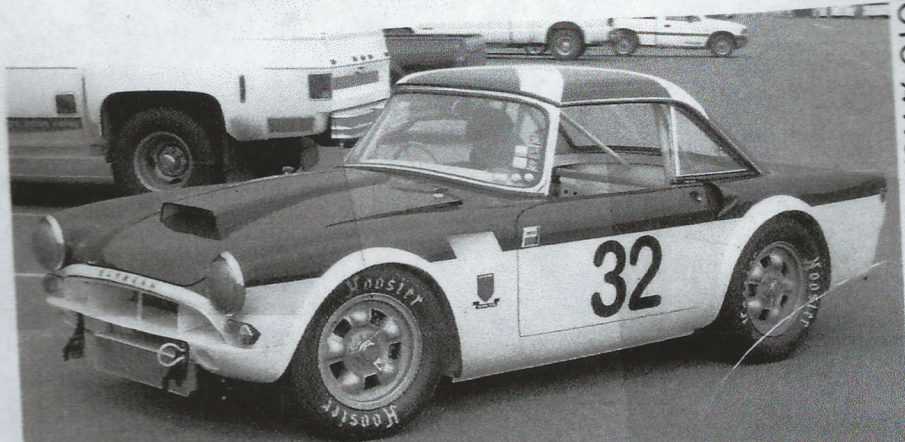
PHOTO 3/4 Front