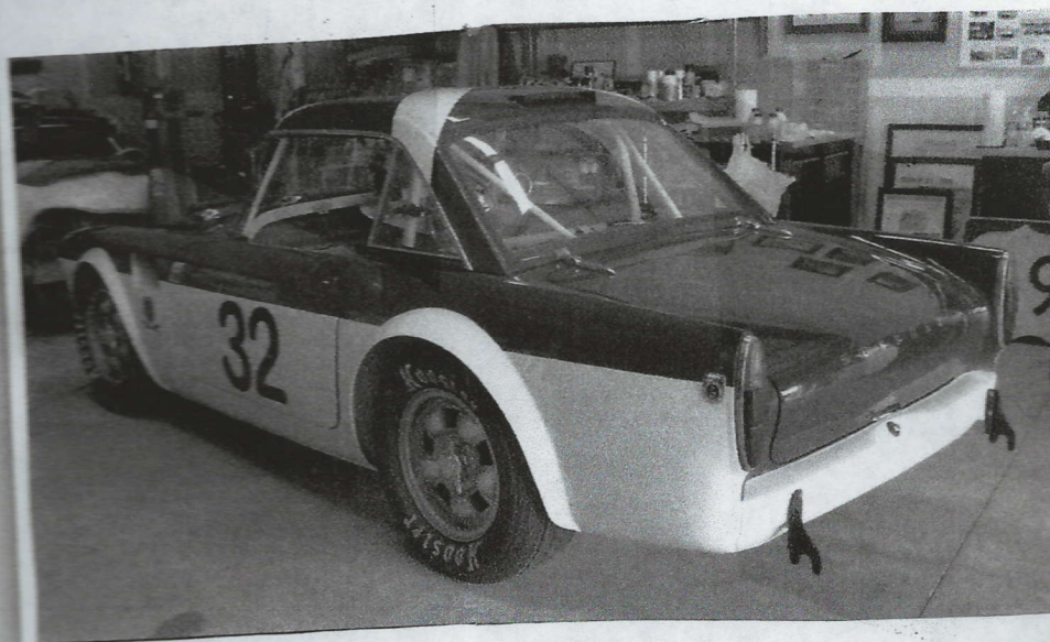
PHOTO 3/4 Rear